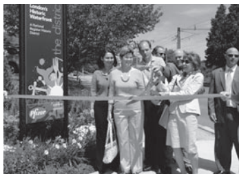
District Gateways Ribbon Cutting June 22, 2010