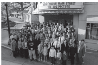
The Big Picture 2010

Are YOU in The Big Picture? Thank you to the Garde Arts Center for graciously hosting this year’s community photo and lending their marquee for the occasion. The photo was used on our Annual Report cover and other print materials to remind all of you how important your role is in The Big Picture. We are grateful to photographer Vinnie Scarano, who, by the way, rounded out the number of participants to an even 100.